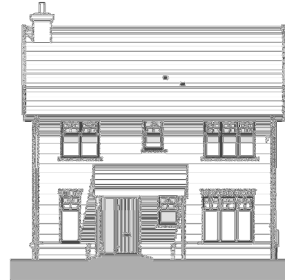
Morton House Type