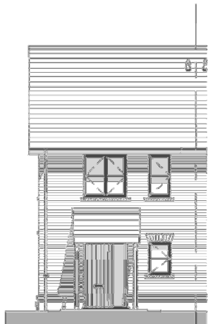
Cranford House type