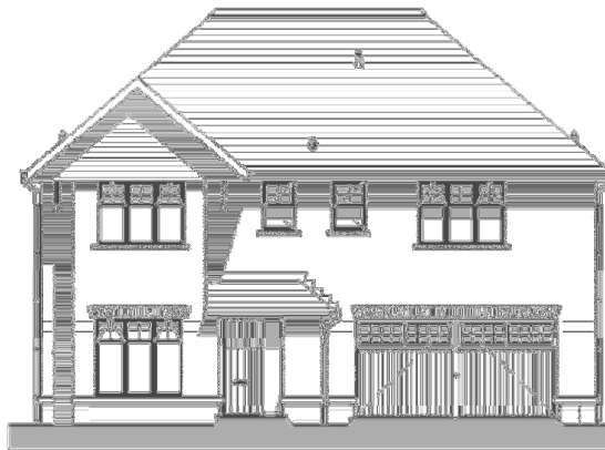
Cotham House type